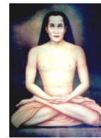
Kriya Babaji Nagaraj