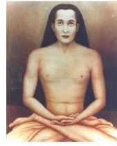
Kriya Babaji Nagaraj