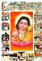
The 18 Siddhas