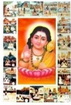
The 18 Siddhas