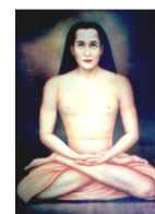
Kriya Babaji Nagaraj